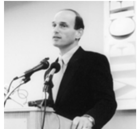
Gov. John Baldacci keynotes at MECEP State Budget Forum